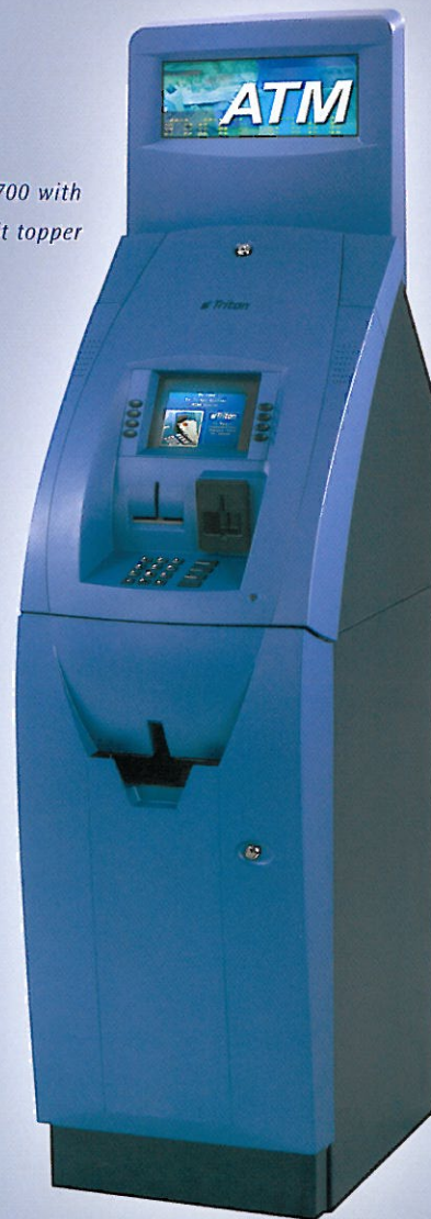
9700 with backlit topper

For additional information on any of the ATMs in Triton's line-up, please visit our website at www.tritonatm.com .