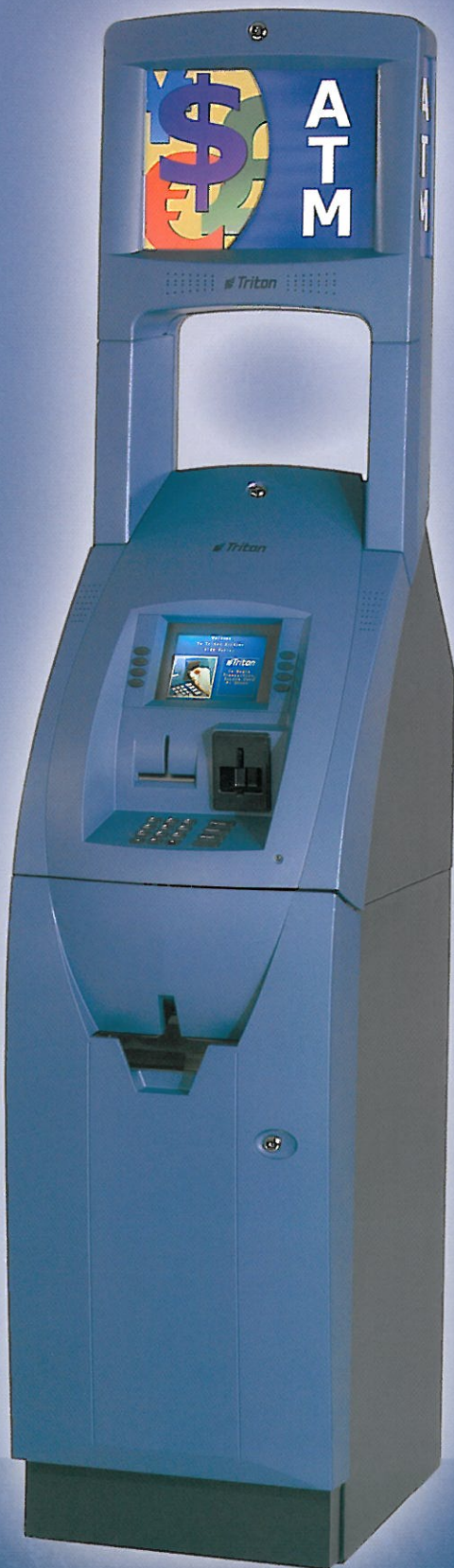
9700 with backlit high topper

Triton's 9700 series ATMs are the perfect low-cost solution for today's retail ATM market. These sleek, new machines offer legendary Triton reliability and a host of standard features that are upgrades on other ATMs—all at an unbeatable price. That's what makes the 9700 the new workhorse of the industry.