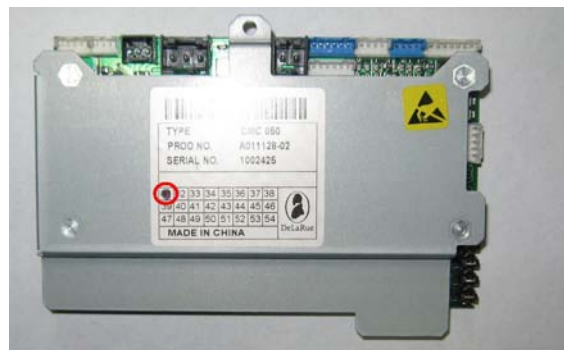
Photo Showing Revision Mark Location on Improved CMC Board

A: The Talaris CMC part number has not changed, but an improved CMC board may be identified by examining the CMC's board revision on its cover. If the revision box "31" is marked, the CMC board is the improved version for polymer note handling: