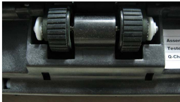
Tractor Rollers Necessary for Proper Polymer Note Picking