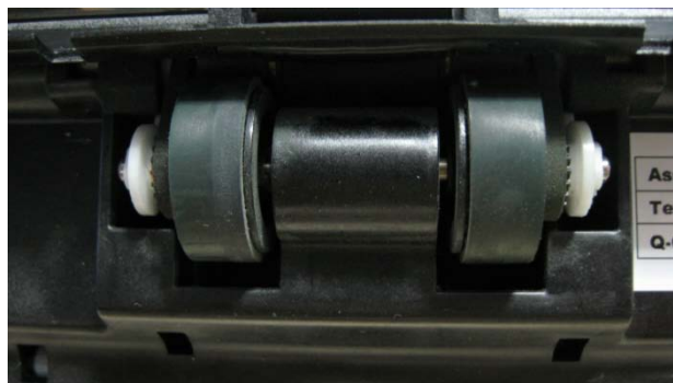
Smooth Rollers Used on NMD50 Revisions 1 and 2