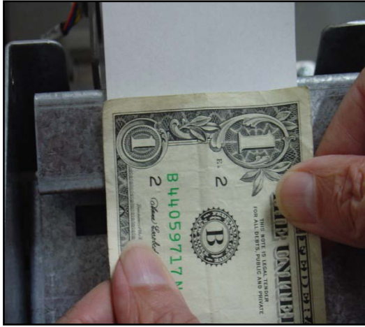
60mm cutter sizing

will be slightly wider than the folded bill, or 3.15 inches. A 60mm unit will closely match the width of a dollar bill, or 2.36 inches.