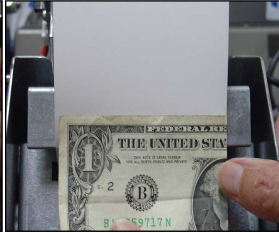
80mm cutter sizing

When ordering, determine unit model and ask for part number: