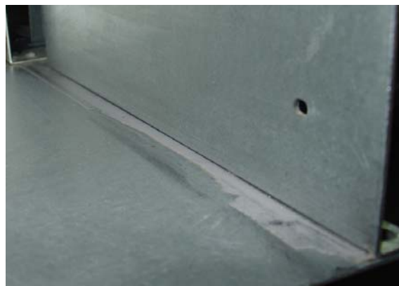
Peeling, worn Teflon strip

If you have any questions, please contact Technical Support or our Parts Department at 1-228-575-3100 from outside North America or toll free in the U.S./ Canada 1-800-259-6672.